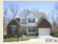
8603 Driscoll Ct $369,900