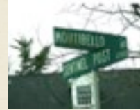
4822 Sentinel Post Rd $795,000