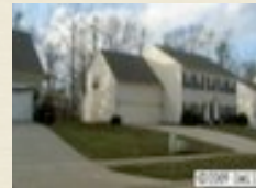
7900 Antique Cir $194,500