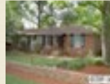
1622 Geneva Ct $349,000