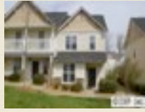
11026 Dundarrach Ln 52 $147,500