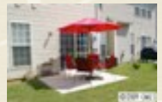
12416 Crowley Ct $179,900