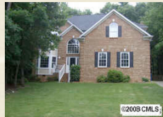
2805 Bathgate Ln $189,900