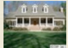
1221 Kingscross Dr $935,000