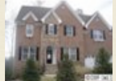
13905 Shanghai Links Pl $489,900