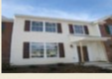
2122 Aston Mill Pl $131,764