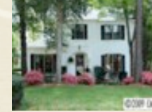
912 Black Oak $220,500