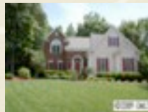
4703 Avonwood Ln $389,900