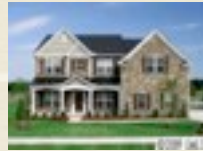
3004 Clover Hill Rd $350,000