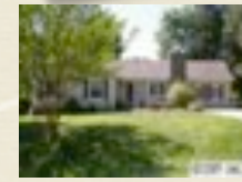
11509 Winding Way $198,000