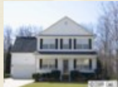
9309 White Aspin Pl $175,000