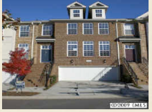
3345 Luke Crossing Dr $300,000