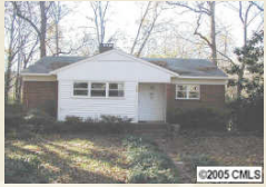
5206 Valley Stream Rd $92,000