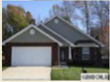
916 Catawba Wells Ct $172,900