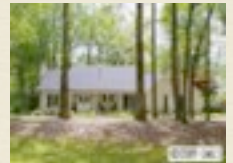
4000 Columbine Cir $639,000