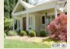
1904 Winter St $599,000