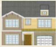
5536 Tipperton Way $139,900