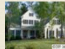
8628 Brookgreen Dr $398,500