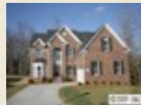
1805 Grafing Ct $359,000