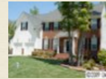
6748 Olde Sycamore Dr $375,000