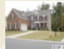
430 Ranelagh Dr $428,900