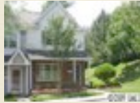
1760 Forest Side Ln $94,000