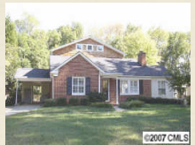
2309 Cumberland Ave $420,000