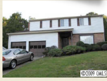
6720 Morganford Rd $123,497